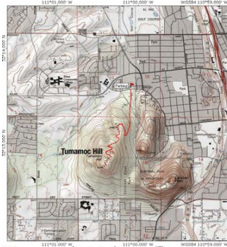
Topo map of Tumamoc Hill

We're making a Tumamoc sandwich this year and want all of you to join us. Between the Ides of March and Tax Day , athletes, students, council members, and community supporters will break a sweat climbing that great old hill west of downtown Tucson for Kore Press. Summit as many times as you can in those 30 days solo or with a team. If you can't walk, please consider sponsoring someone or building a team to help us reach our goal. A buck a climb, a mile, or perhaps a donation for the whole nine yards. We aiming high!