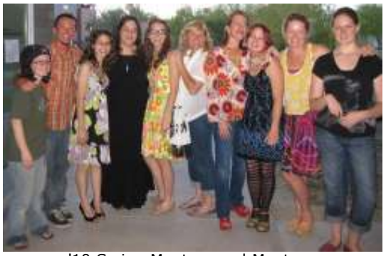
'10 Spring Mentors and Mentees